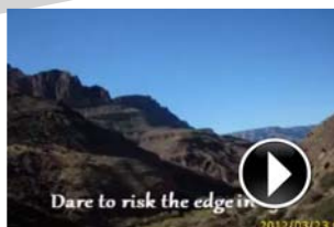
From The Inside