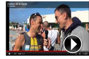
Duatlon de la Santa