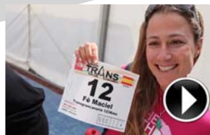
The North Face® Transgrancanaria® 2012