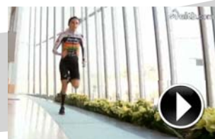
Virginia Berasategui Iberdrola Tower