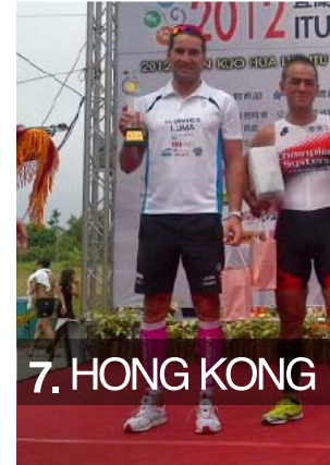
7. HONG KONG