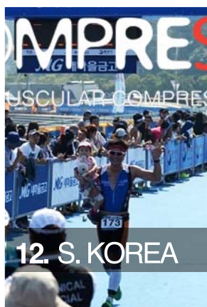
12. S. KOREA