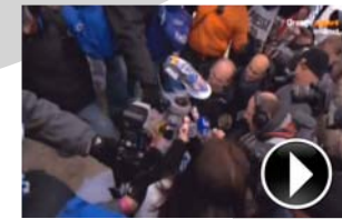
Enduropole du Touquet 2012