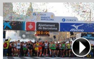
Zurich Marató Barcelona 2012