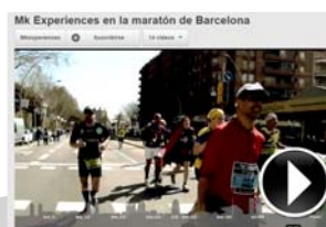
MK Experience Marathon Barcelona