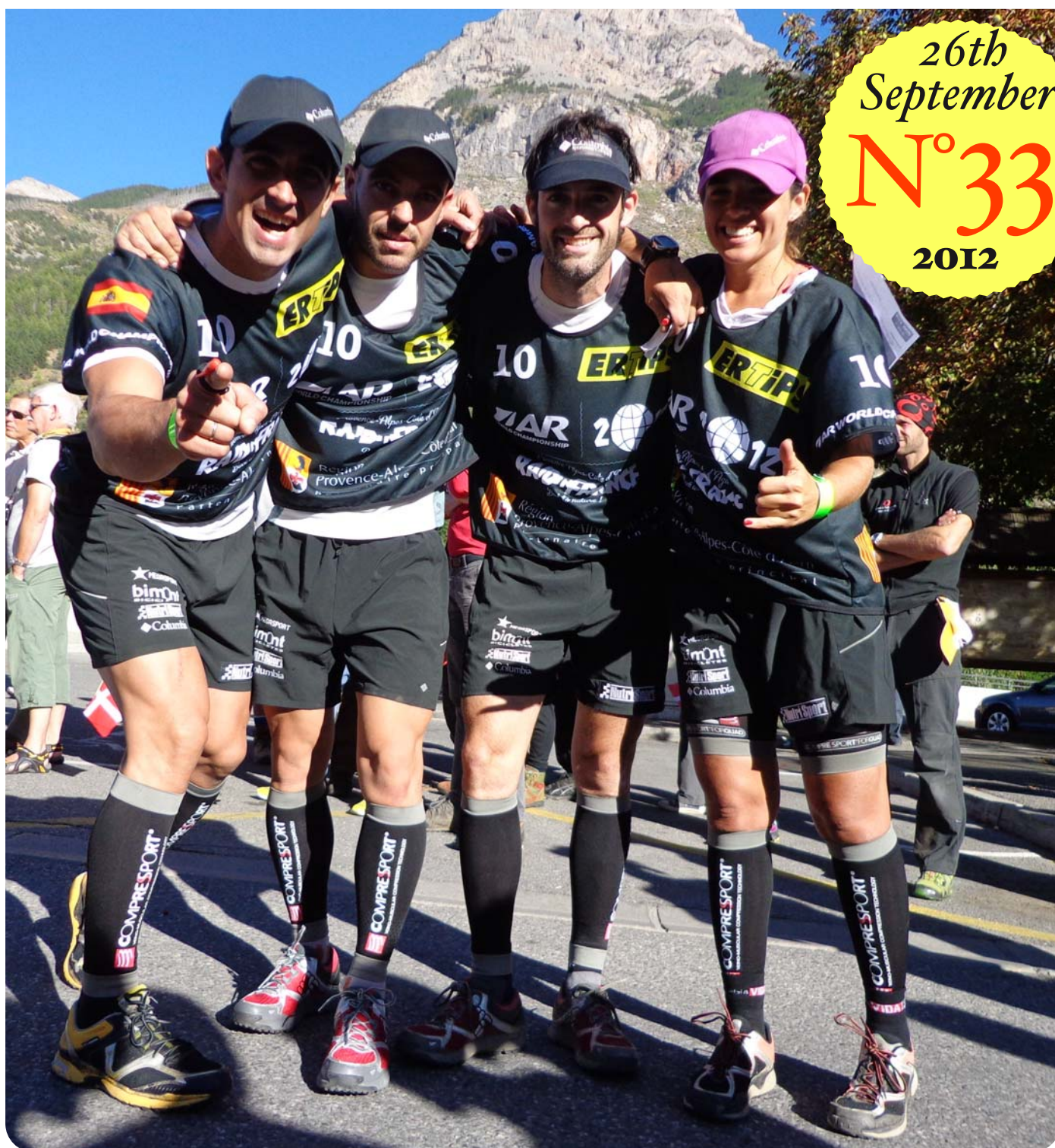
Vidaraid Adventure Team top ten in the world championship