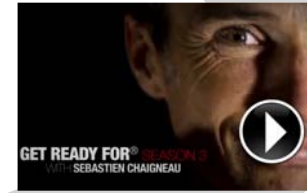
The North Face® Transgrancanaria® 2012